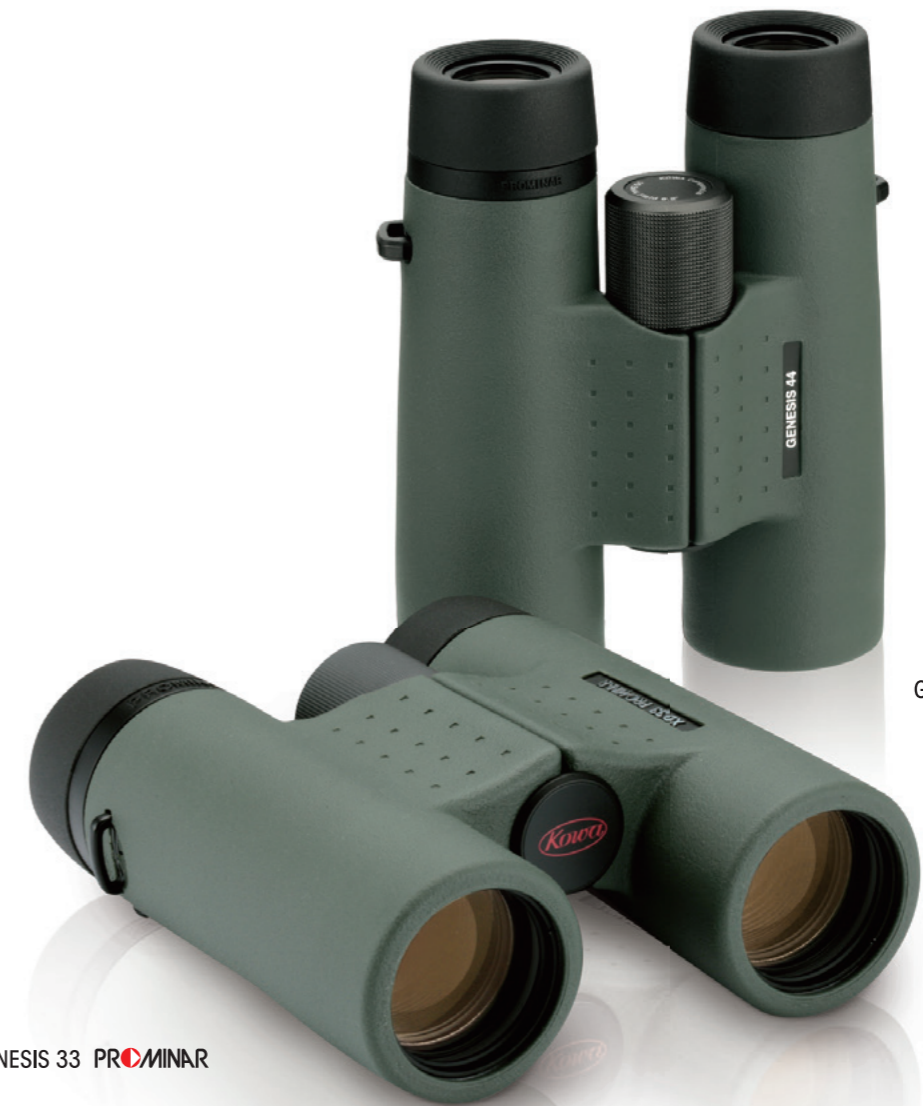
GENESIS 33 PROMINAR