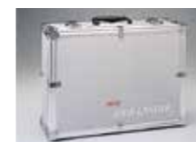
BL8J-AC Dedicated Aluminum Case Weight: 3.4kg