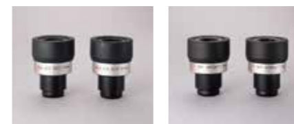
TE-21WH 21x WIDE TE-9WH 50x WIDE