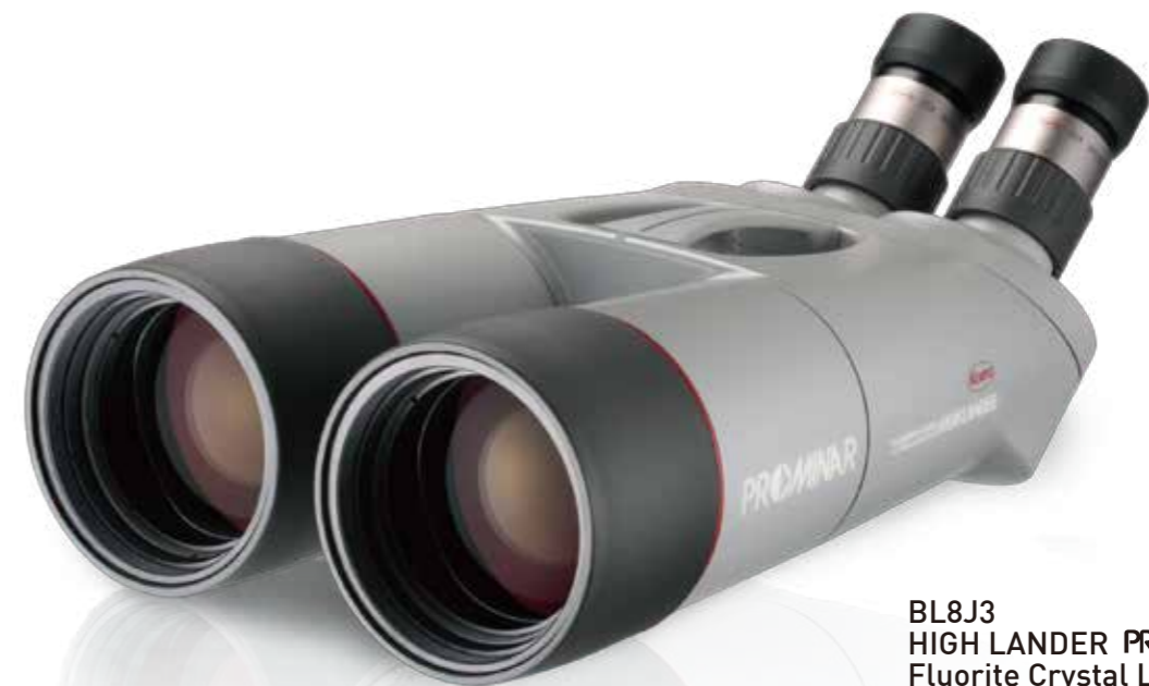
BL8J3 HIGH LANDER PROMINAR Fluorite Crystal Lens

All lenses, prisms, and dustproof glass are fully multi-coated ensuring a clear visual range and sharp images.